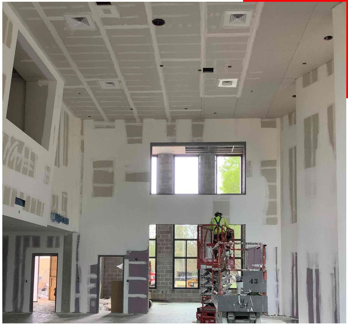
Gypsum Board Progress in Media Center Double Height Space